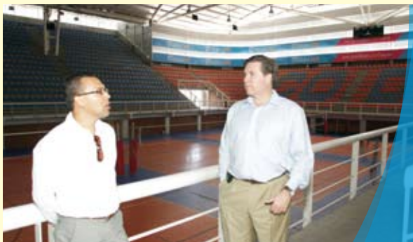
Site visit to Guadalajara 2011 venue

On behalf of everyone at Toronto 2015, thanks to Vancouver and Guadalajara. The Olympic Winter Games of 2010 were magical and we know that PASO will be thrilled with the 2011 Games in Mexico.